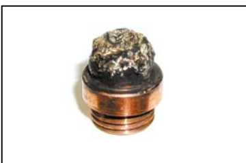
Low gas or no gas (Nozzle snuffing)

The electrode should burn to approximately 0.120” before cut quality deterioration or failure. You may need to increase arc voltage by 5-10 volts to maintain proper stand off. Some operators use 2 nozzles to get full life from the electrode.